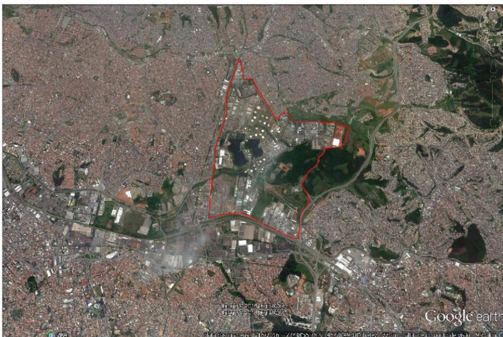
Figure 1: Satellite image showing the Capuava Petrochemical Complex (CPC) area (outlined in red)

This is a cohort study. We evaluated residents living in the area close to the Capuava Petrochemical Complex (CPC) (Fig. 1) in the Greater ABC region from July 2003 through June 2005.