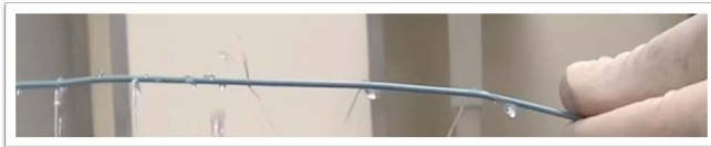
Figure 2: Flushing the catheter with heparinized saline.

Finally, we have a physician modified infusion catheter that can be used immediately for the Catheter Directed Thrombolysis (CDT) (Video). We can use the same idea for creation of catheters with different shapes and purposes.