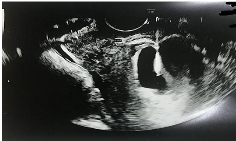
Figure 2: A 20-gauge needle was inserted into the sac using a puncture instrument (GIP; Wilson-Cook) by transvaginal ultrasonography and MTX was injected directly in the gestational sac.

The 12 patients in the local MTX group received an injection of MTX 25 mg/mL solution (1 mg/kg, body surface area) directly into the cornual lesion. The sono-guided MTX injection procedures were performed as follow. Under no anesthesia, a 20-gauge needle was inserted into the sac using a puncture instrument (GIP; Wilson-Cook) by transvaginal ultrasonography. After aspiration of the celomic fluid, MTX was injected directly in the gestational sac (Figure 2). The procedure was performed in the operating room and no general anesthesia was used, although arrangements had been made for general anesthesia in the event of an emergency. Nevertheless, we prepared for situations where emergency exploratory surgery may be necessary ensuring abundant surrounding vessels in the cornual area of the uterus. No immediate procedure-related complications occurred. Ultrasonography was performed for approximately a few minutes after the injection to confirm that the procedure was complete without any post-procedural complications.